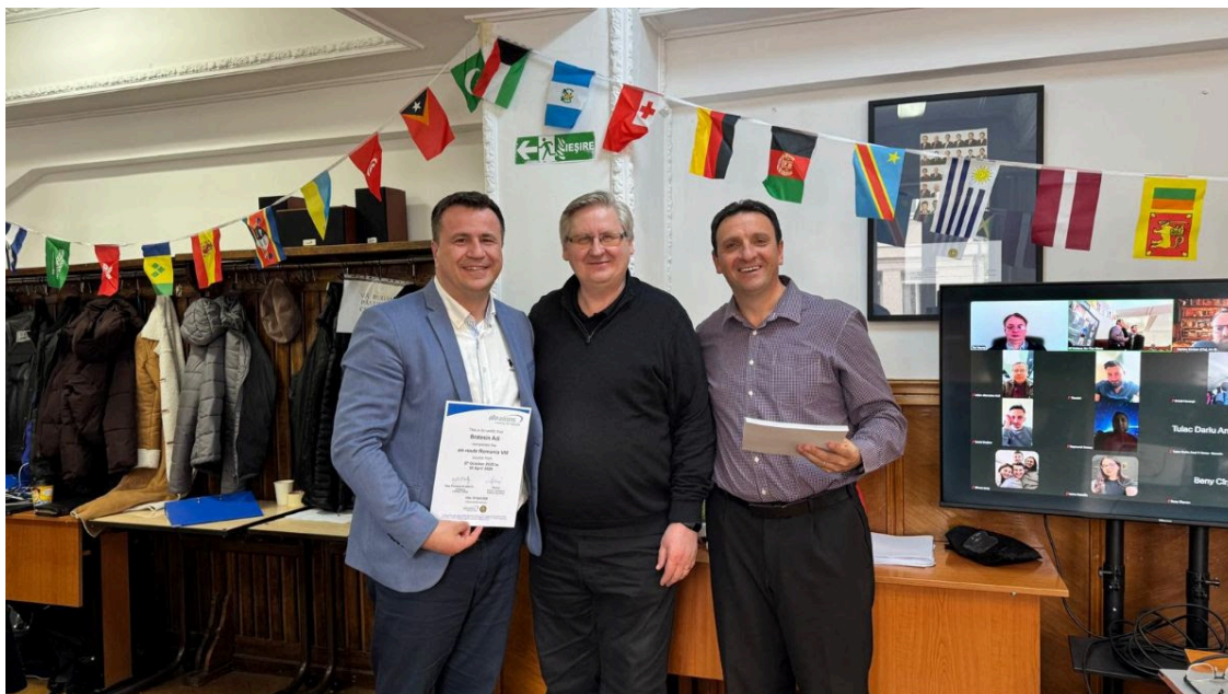
One of our graduates (left) is the CEO of the recently started Romanian Baptist Mission Agency „ProMis”

The first event we had in Romania after the European Member Care Consultation in Italy was teaching the last week of the 8 th edition of the EnRoute Romania mission course. For some, this was the first time they stepped foot into a mosque and heard the message of Islam. We are often not familiar with it nor do we know how to interact with it. A challenge the participants faced was practical evangelism in the Red Dragon commercial centre. They had to speak to only foreigners - a challenge for those who had never been exposed to these situations. It is very hard to present the Gospel in a foreign language or to those who only partially understand the language you are speaking in with them. However, all the participants were encouraged by the fact that they had the opportunity to share the Saving Truth with immigrants in our country.