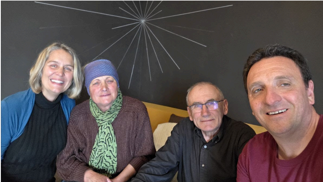
A hard working family of servants in Oltenia

5-10 May found us at the Oasis with the Father retreat in Craiova , which we usually organise in Dobrogea. We discovered a great need there for support and care for local workers, who face family issues (illnesses, strained relationships, bereavement, children walking away from the faith, etc.), issues in ministry (small and difficult churches, conflict in ministry teams, demonic attacks on workers and their families, etc.), and financial or social issues (unfriendly neighbours, infamous neighbourhoods, etc.). One of the families we met with told us: "We have given all that we are and have to ministry in this region. Exhaustion quickly took over, and the expectations we and those who sent us had regarding fruit became clearly unrealistic. We work 10 times harder than in other areas of the country, only to achieve 10 times less than we have experienced in previous projects in other areas of the country." The needs of these faithful workers are vast, and the task of coming alongside them is humbling. Therefore, please come alongside us in prayer, as we continue to walk with these dear workers. We need your prayers, and so do they. We rely on your support!