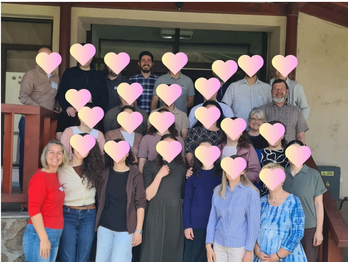
Our small team and the first generation of students

The Member Care Training Course which took place in Sibiu between 14-16 May was very well received. We are encouraged to see the eagerness of the participants to learn how to shepherd global and national workers. One participant told us: "It is a great answer to prayer, as we prayed for years for a course like this to be launched in Romania, in Romanian." Someone else let us know that "it's a dream come true to be able to participate in a course like this one." We are overwhelmed by the openness and eagerness of the participants. We can say that the 25 people who took part are the cream of the missionary organisations in Romania which offer (or