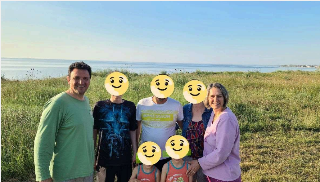
They surprised us before 6.00 am.

During our time there we were surprised one very early morning to receive the visit of a dear missionary family we've been caring for the past few years, who drove all the way from Mongolia, for about two weeks, for their visit home. They just wanted to see us, even for a short while, on their way back to their families.