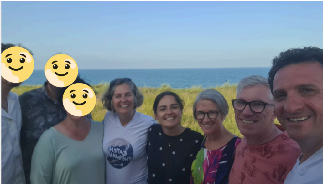
Our team and one of the participating families

During our time there we were surprised one very early morning to receive the visit of a dear missionary family we've been caring for the past few years, who drove all the way from Mongolia, for about two weeks, for their visit home. They just wanted to see us, even for a short while, on their way back to their families.